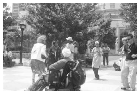
Participants celebrate the conclusion of the 2005 Summer Institute.